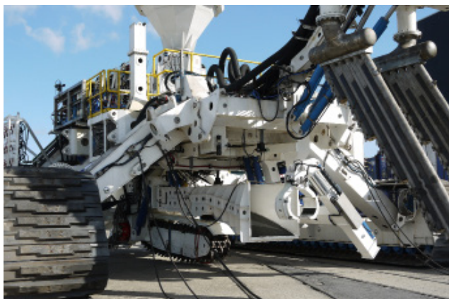
Single Chain Cutter System

The T-3200 is not limited to these parameters and can be modified by DeepOcean to complete worksopes in excess of its current configuration.