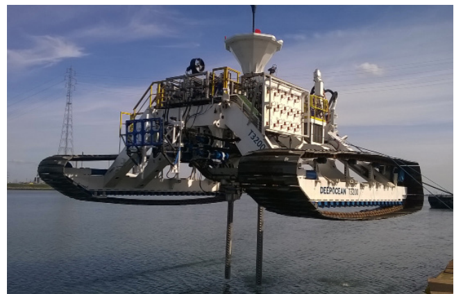
Jet Trenching System